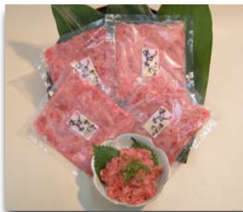
Negitoro Steak (Minced TUNA)